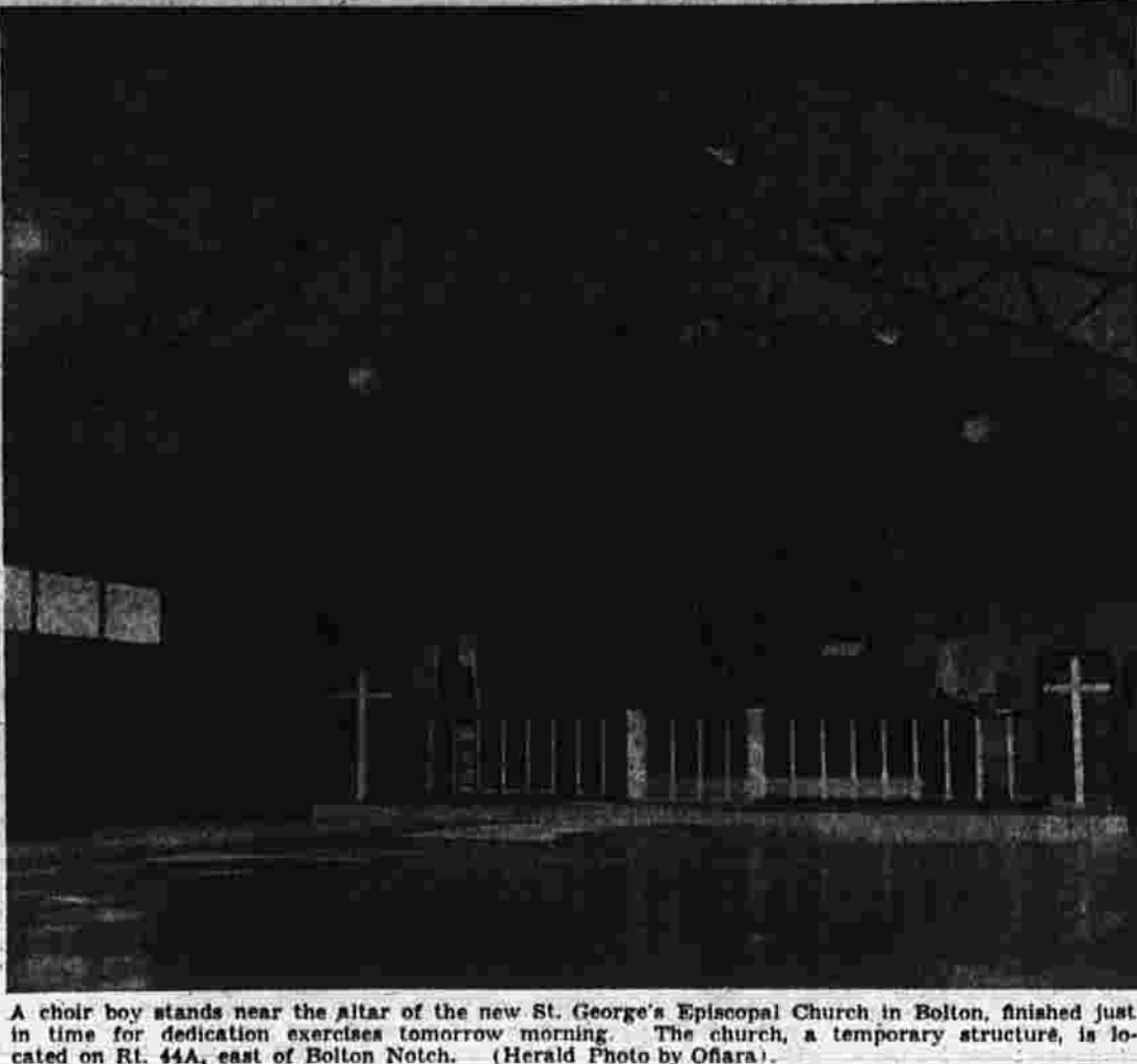
A choir boy stands near the altar of the new St. George's Episcopal Church in Bolton, finished just in time for dedication exercises tomorrow morning. The church, a temporary structure, is located on Rt. 44A, east of Bolton Notch.

Featuring: Center hall layout, Three twin-sized bedrooms, Formal Dining room, Two colored ceramic tile baths, "Picture-Book" kitchen with Gregg pre-finished cabinets, formica counters, all stainless steel electric built-ins, dining nook, Finished and heated recreation room 13x29, laundry room, two-car garage, Buena mahogany trim and doors, Lot completely graded, seeded and shrubbed, Automatic drive, AA Zone. Make an appointment to see this excellent property which has been Bank Appraised and is selling for $27,500. OPEN FOR INSPECTION all day Saturday and Sunday—70 DALY ROAD. BUILDER—MI 9-5524